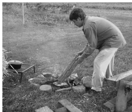
table spilled over with all kinds of soups, casseroles, salads and desserts. Picnicking stretched out across the farm to the site of the bonfire, just south of the river birch tree at the center of the farm.

It was an honor for us to have so many families come out to spend the evening with us, and a true treat to try all the different dishes. We're convinced our shareholders are made up of some of the finest chefs in Lancaster County. Around 70 people came out for the event, filling the barn with families, while the conference