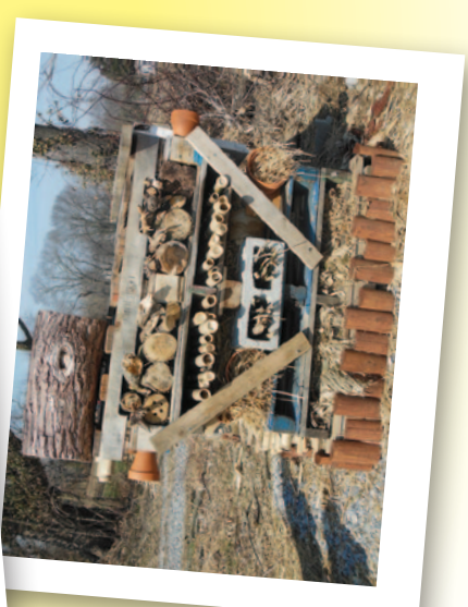
more information of 2 bad bees