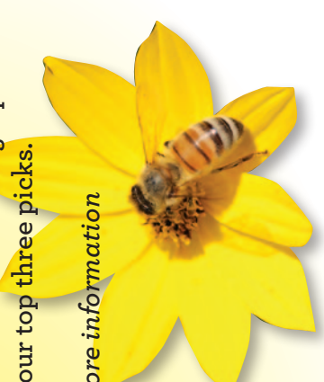
Honeybee

announcers on Facebook and on our website at www.homefields.org . Special prizes await our top three picks.