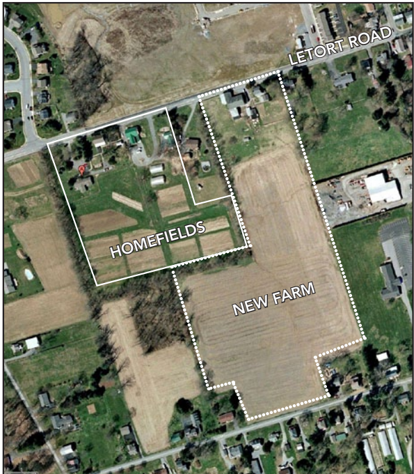
An aerial photograph compares the size of our existing property (8 acres) to the 14 acres supplied by the recent acquisition.

service, please give the office a call at 717-872-2012, or contact more information fields Board of Directors, ee or staffing an event.