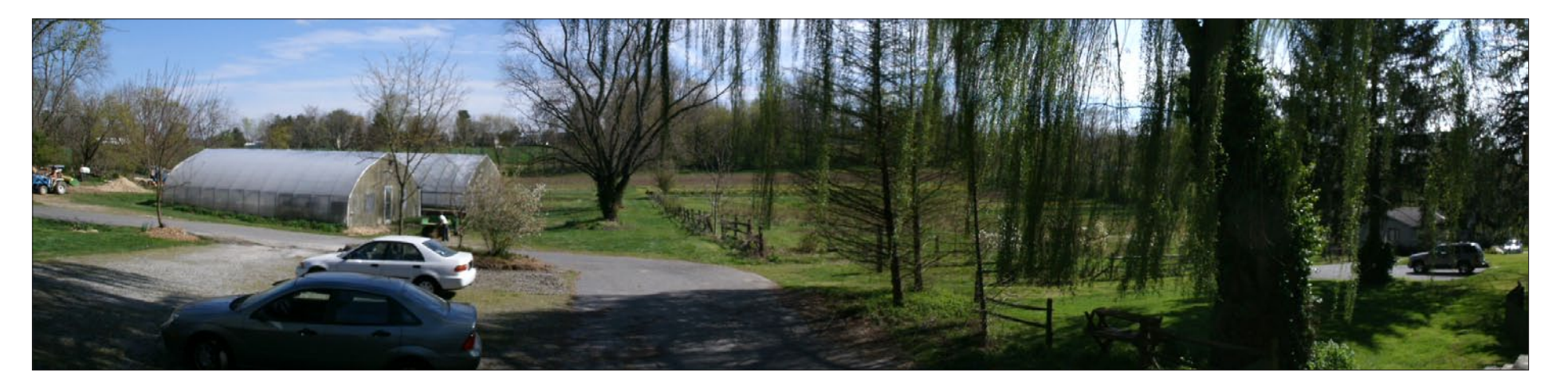
A panoramic of the property from the main barn shows the greenhouses on the left and the ranch house on the right. The fields are toward the treeline.